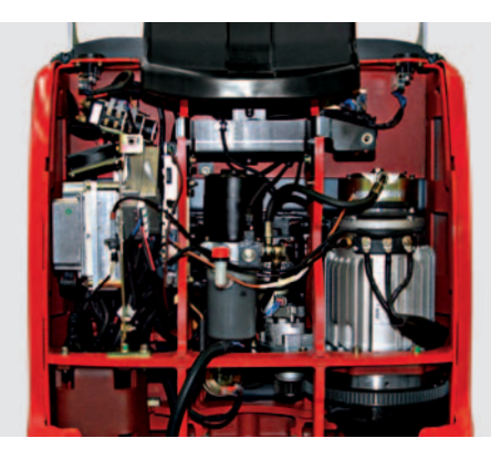
Moisture- and dust-proof motor AC drive technology incorporated in the new N 20/24 does not require any maintenance. Rapid and convenient access to all internal components is provided by simply removing the front service panel.