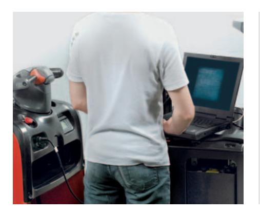
Can bus connectivity All truck data is immediately accessible for the service engineer by plugging into the on-board diagnostic port at the front of the truck. Setting parameters, troubleshooting and preventive maintenance are carried out quickly, easily and on time.